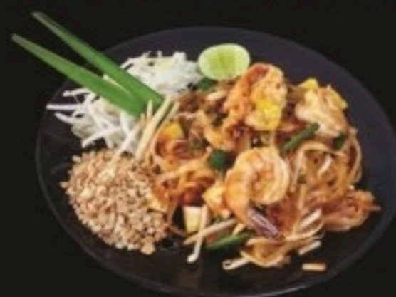
Pad Thai 泰式炒金边粉